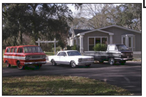
The Watkins - McCullough Corvair Fleet