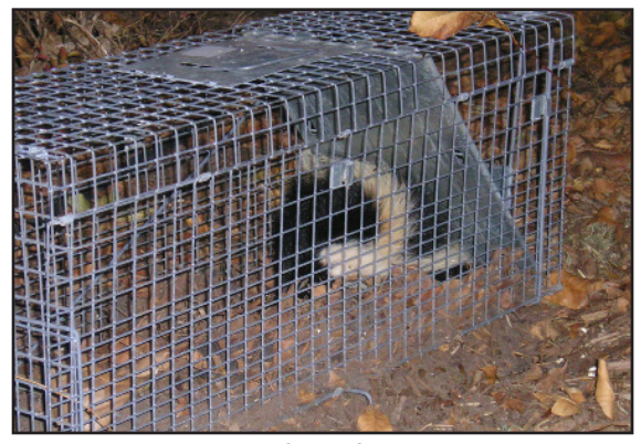
Too Cute to Shoot

the shrubbery and hope that the armadillo will accidentally stumble into it in the dark. So, every day, I checked the trap, found it empty, and moved it near the freshest of the holes that kept marching across our yard. Weeks went by, and I was out inspecting the holes, which by now had reached the far end of the yard, when our daughter opened the back door and let her two beagles and our three poodles loose. The five dogs immediately scattered in five different directions, but #1 daughter only got as far as the live trap when she let out a scream, actually several screams, and Continued on Page 4